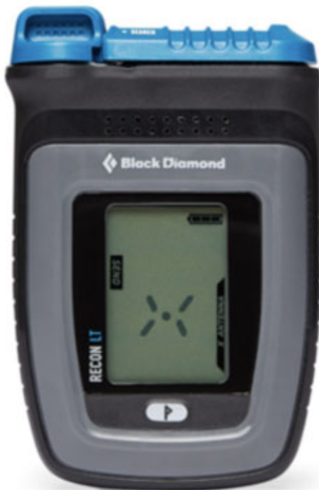
Recalled Black Diamond Recon LT avalanche transceiver